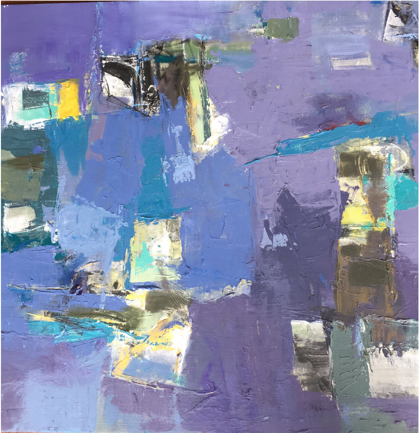
"A New Vision" 30"X30" acrylic on canvas