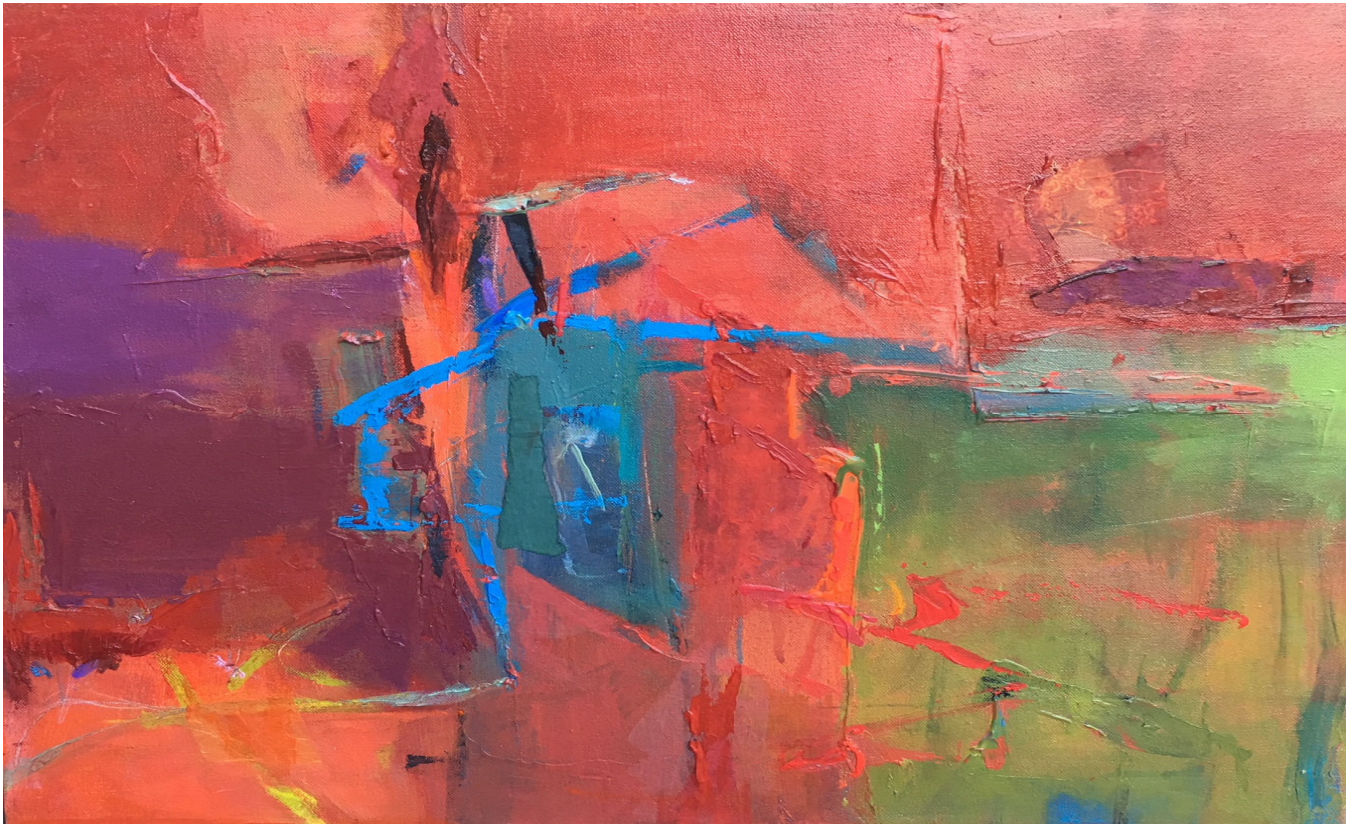
Top: "Lazy Afternoon" 24"X18" acrylic on canvas; Bottom: "Finding a Perfect Place" 24"X18" acrylic on canvas