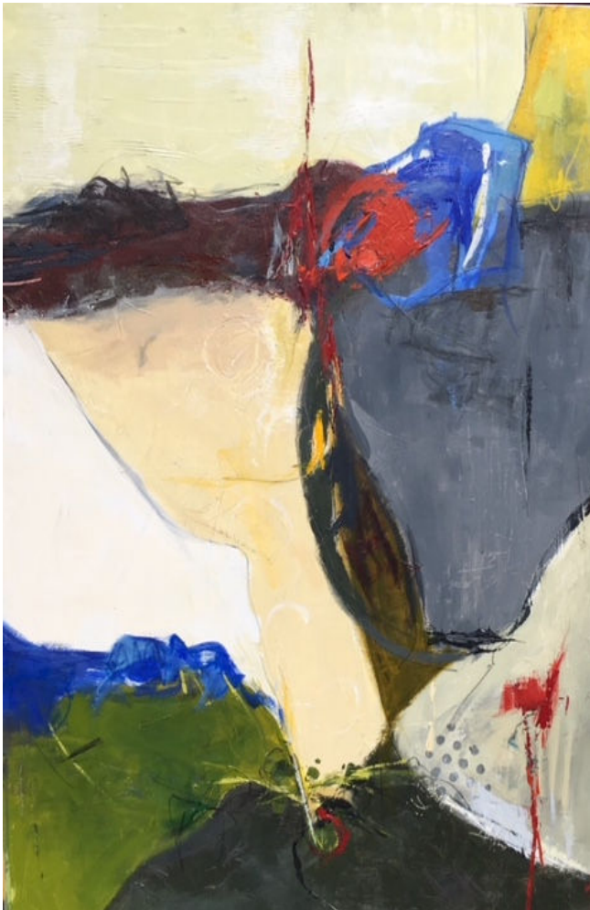
“Riverbend I” 36”X48” acrylic on canvas

MM: The Burning Man exhibit at the Renwick Gallery is both bizarre and wonderfully fun. →