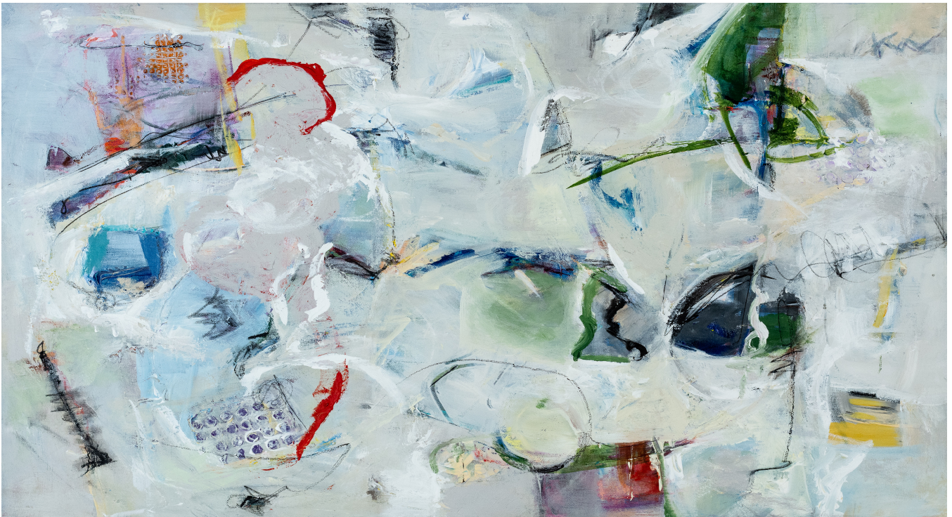
Clockwise from top: "Open Window I & II", 24"X24" acrylic/mixed media on canvas "A Couple of Things" 24"X36" acrylic/mixed media on canvas

energy of networking with other artists.