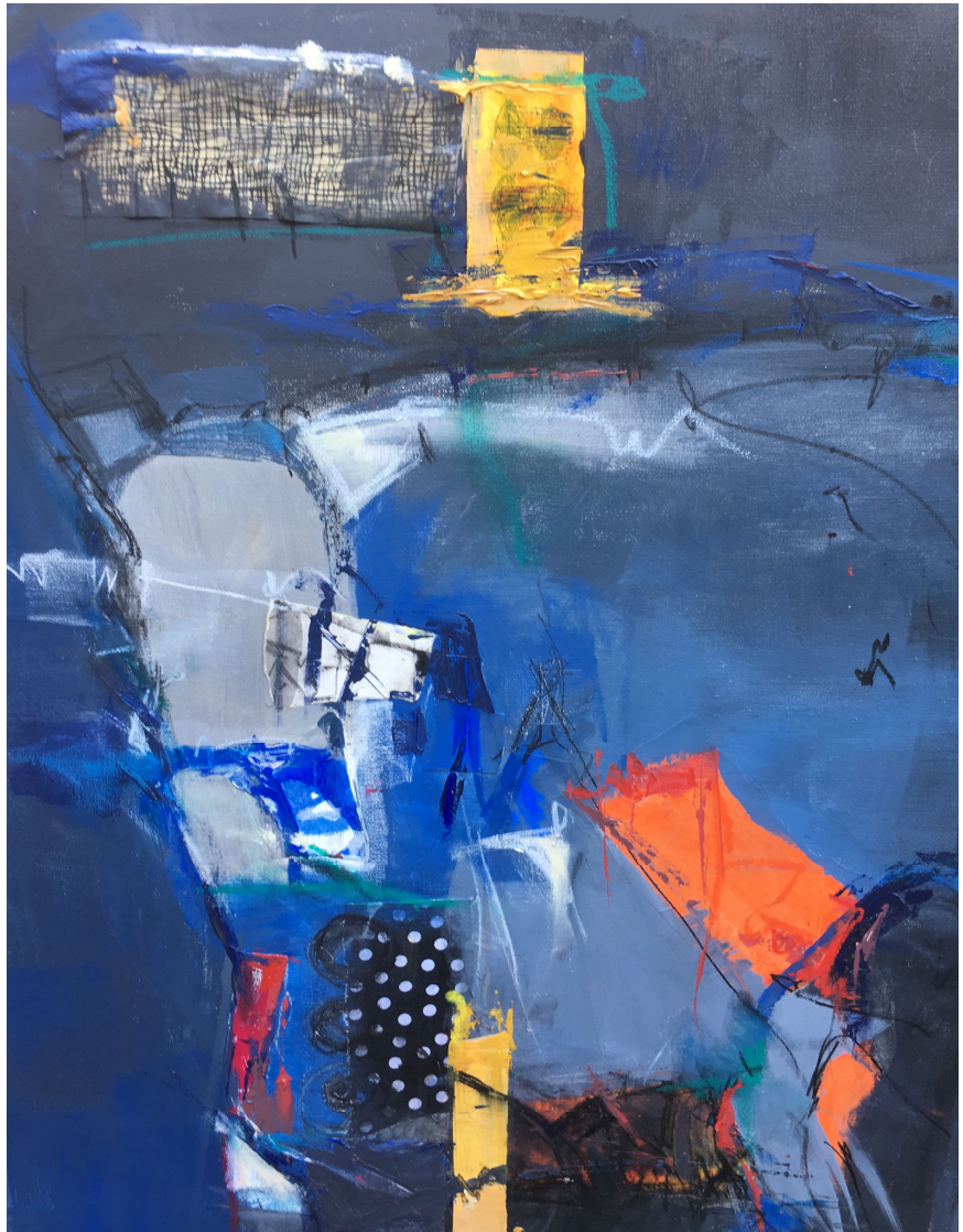
“Follow the Yellow Brick Road” 24”X36” acrylic/mixed media on canvas

MM: I paint from within my self. Sometimes I have a specific idea for a series and complete sketches before starting, often not. Depending on my mood, I may start with a color or two that please me or with lines drawn exuberantly and without hesitation on canvas. It is an intuitive process and I become mesmerized,